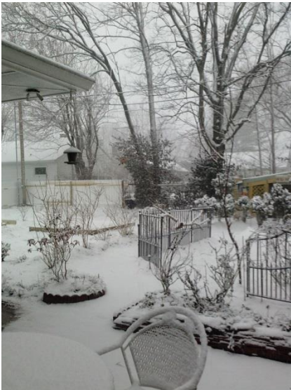
March 2013 snow...

Global warming has all of us wondering –what next? But, with patience, we finally to see sunlight and sure signs of a little spring!